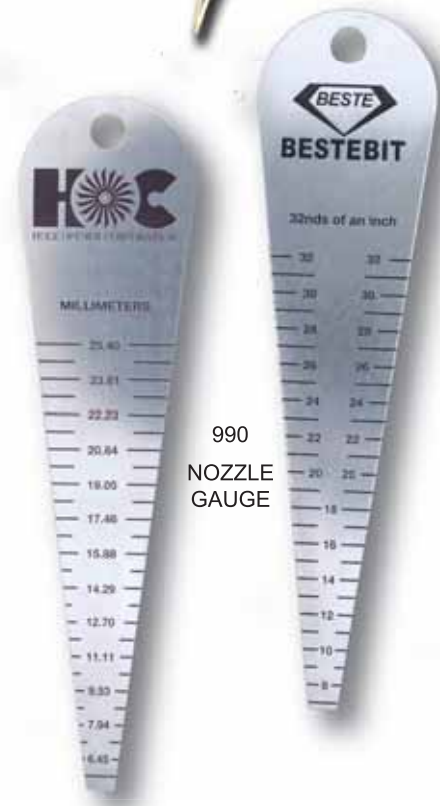
990 NOZZLE GAUGE