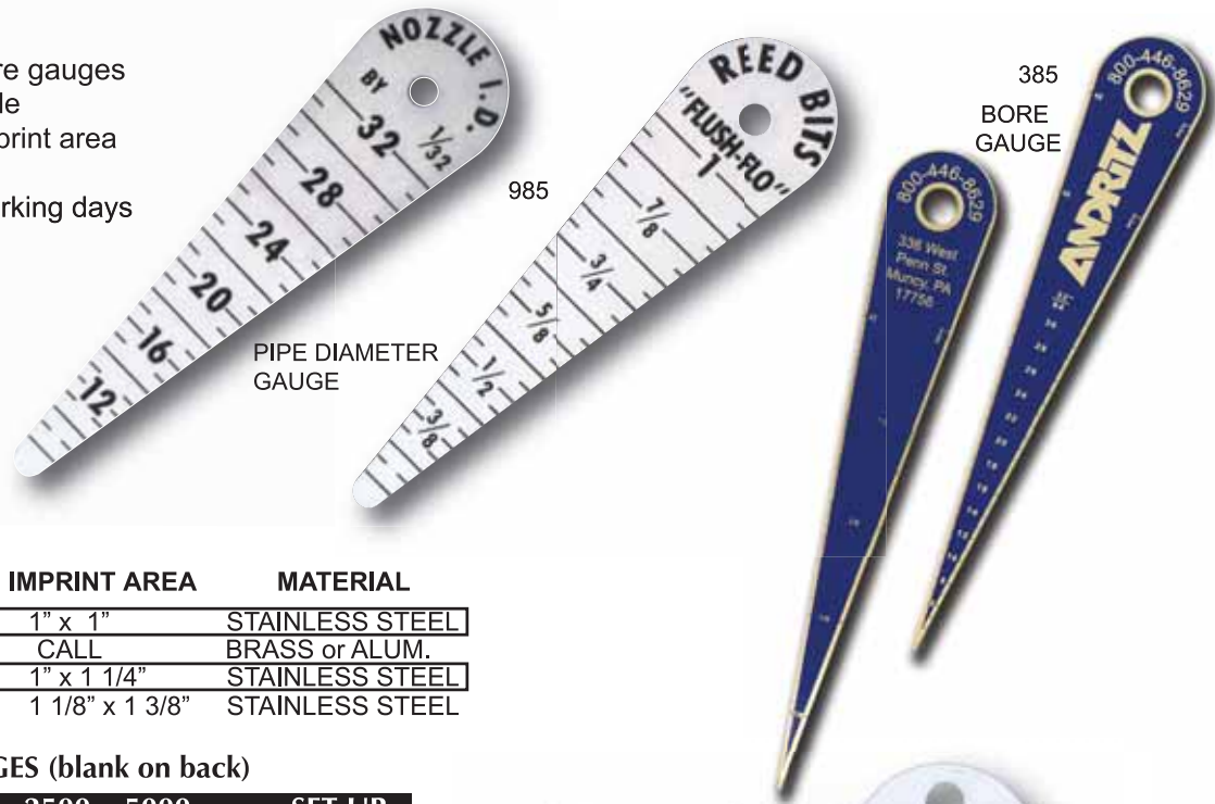
PIPE DIAMETER GAUGE