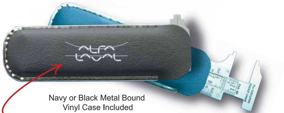
Navy or Black Metal Bound Vinyl Case Included