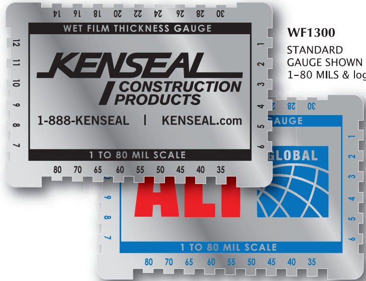
WF1300 STANDARD GAUGE SHOWN 1-80 MILS & logo