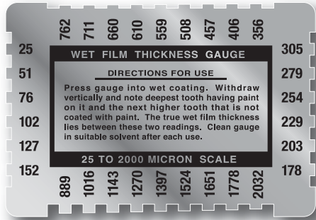
STANDARD BACK for 2nd Side Versions MICRONS & Directions for use

.032 aluminum Durable Graphics one or more colors 1 or 2 sides Size 3 1/4" x 2 1/4" Imprint area 2 1/2" x 1 1/4" on the front Standard production time 10 working days Bulk packed with removable poly coating on face Weight 2.5 lbs per 100